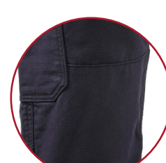
DOUBLE LAYER KNEE