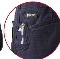
REINFORCED KNIFE CLIP PATCH