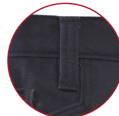
DURABLE BELT LOOPS