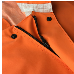
PROTECTION Designed for Chemical Splash