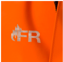
SAFETY Multi-Hazard FR